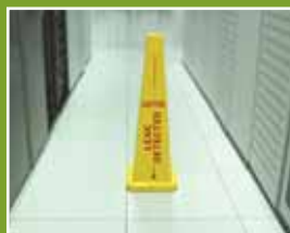
Raised floor computer