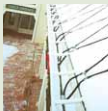
Snow Melting and De-Icing