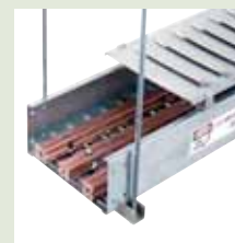
Fire and Performance Wiring