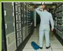
Server and communications facility