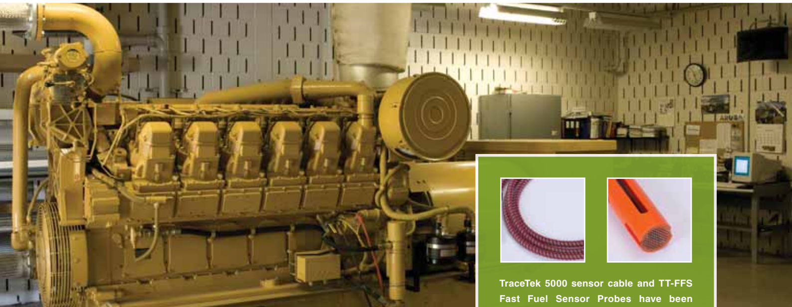
TraceTek 5000 sensor cable and TT-FFS Fast Fuel Sensor Probes have been certified to meet FM 7745 "Approval Standard For Diesel Leak Detectors"