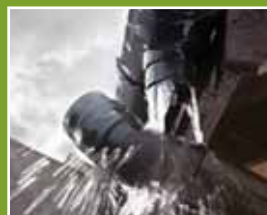
Plumbing systems and suspended pipes

All these features mean you have great design flexibility needed for modern high rise buildings.